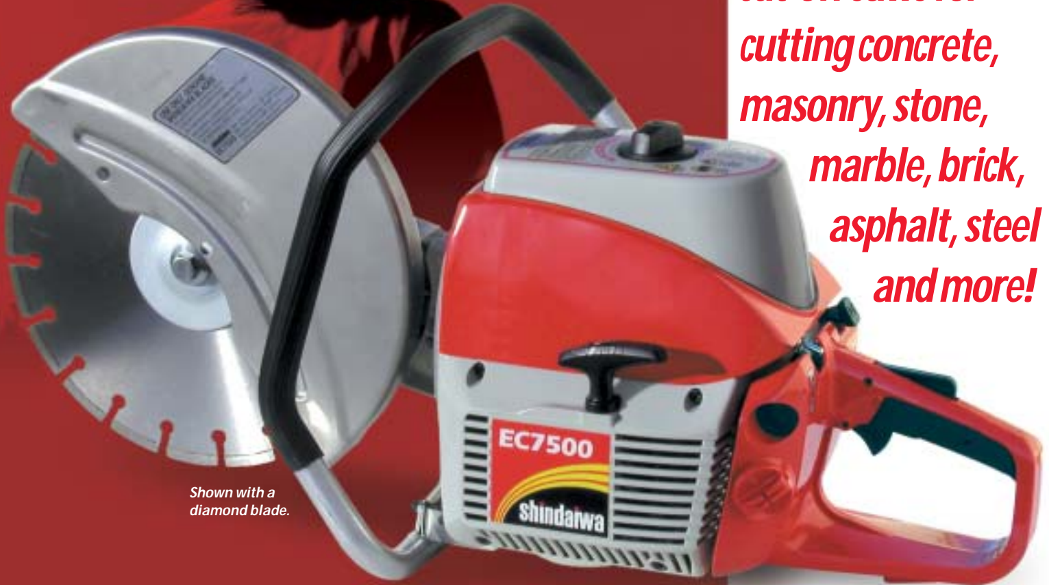
Shown with a diamond blade.

High performance saws tackle heavy-duty cutting with rugged reliability.